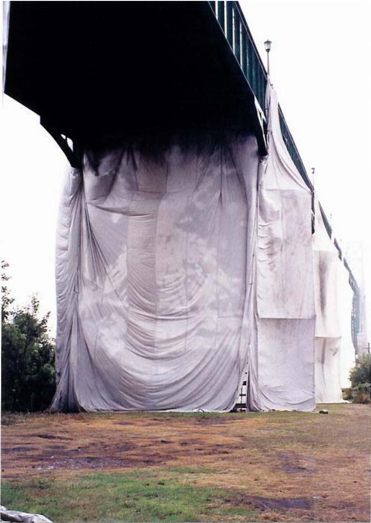
Containment To Grade