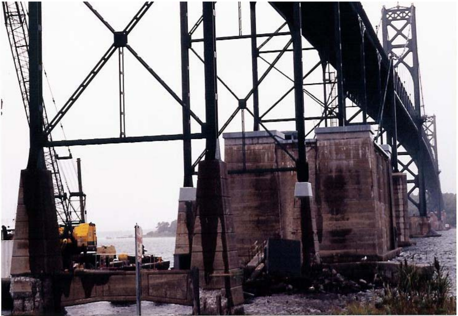
Mount Hope Bridge

PROJECT DESCRIPTION: Blasting & Painting Project Main Span Span & Anchor Spans