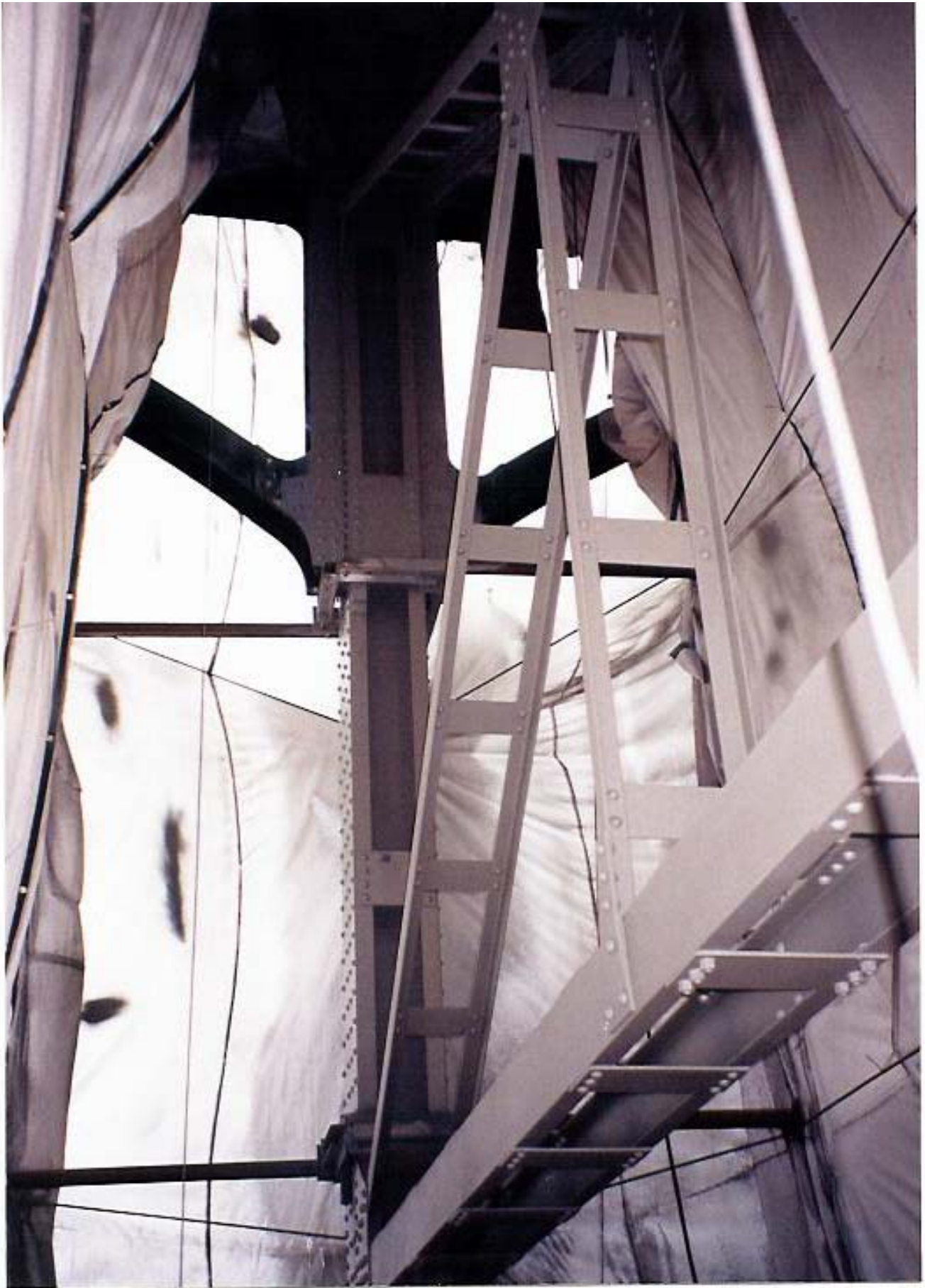
Containment To Grade