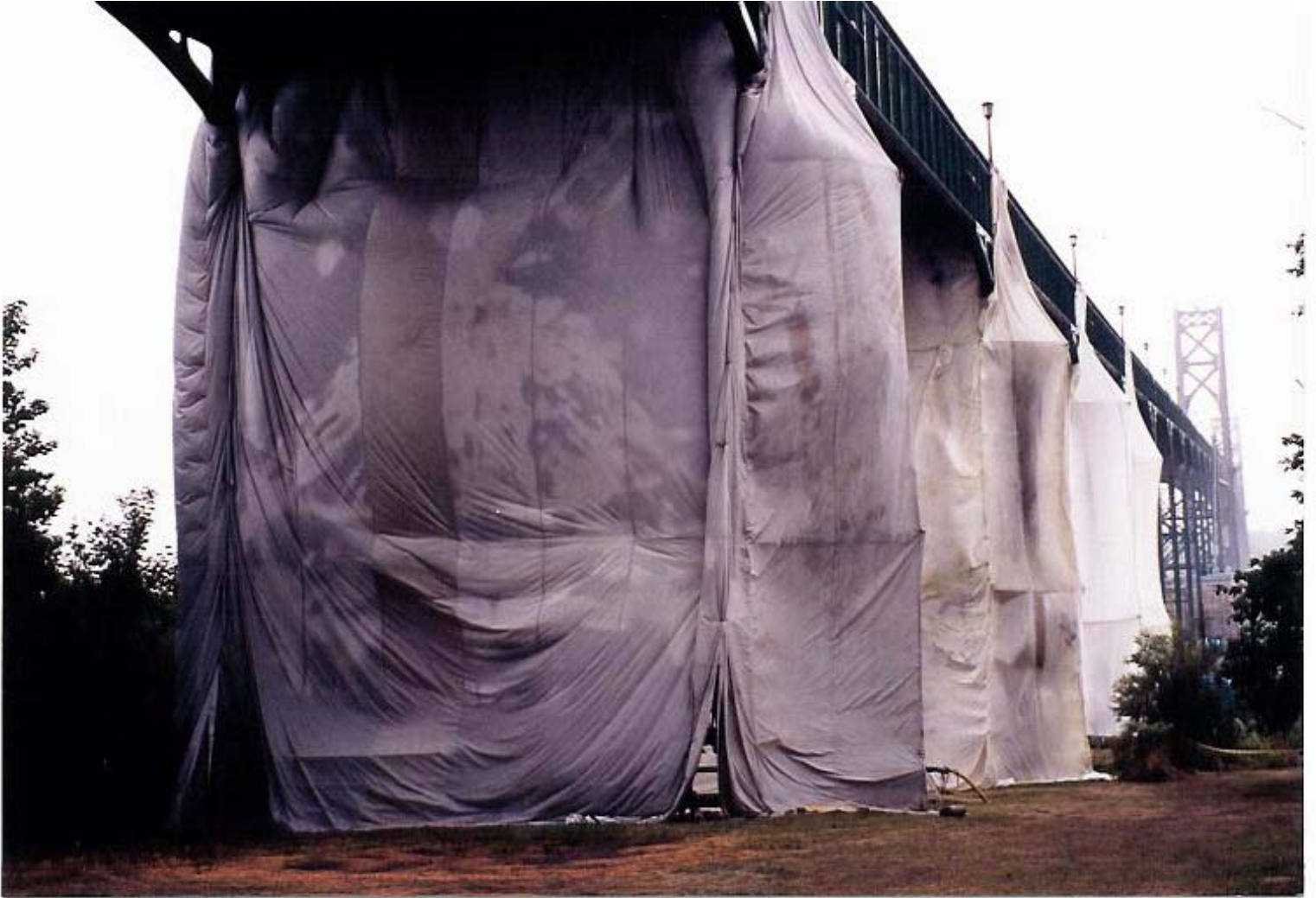
Containment To Grade