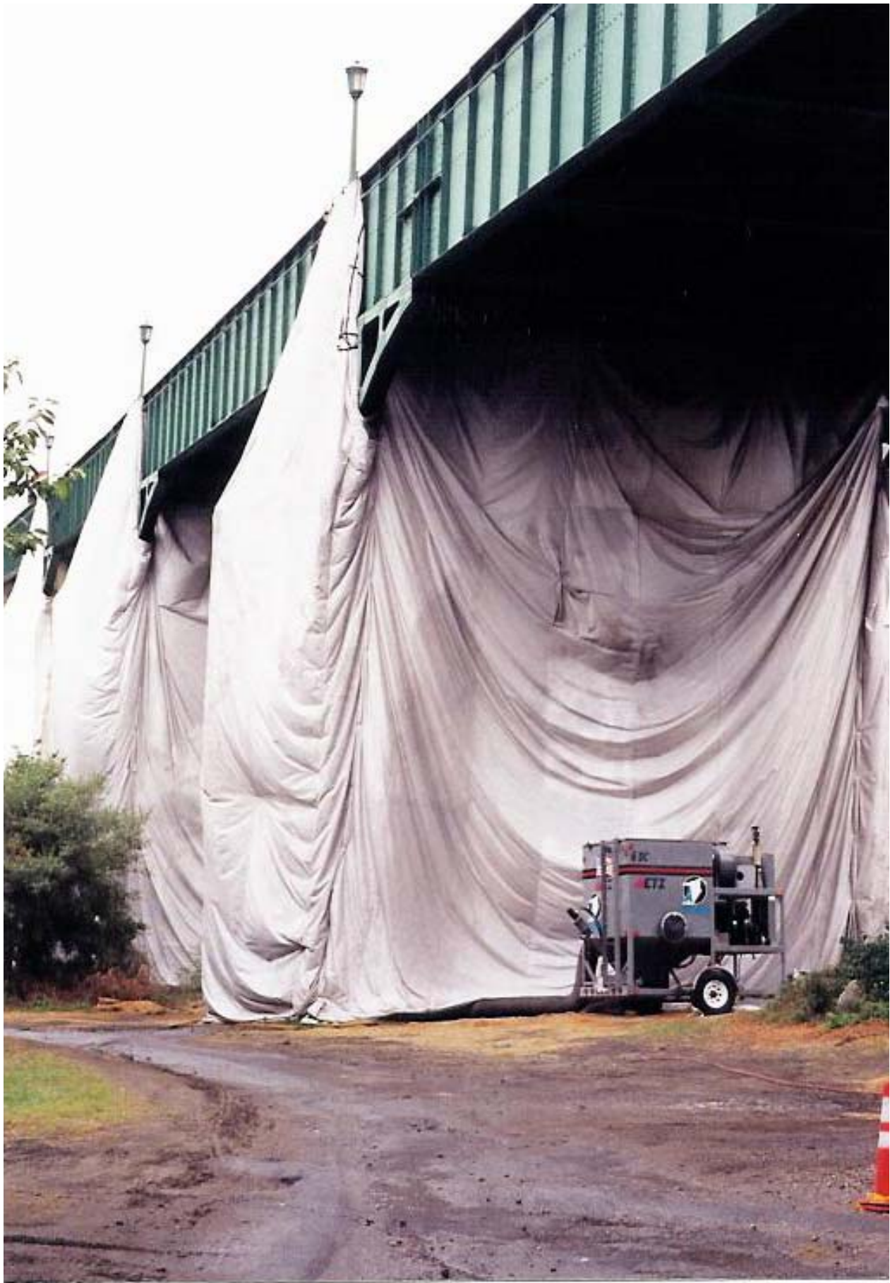
Containment To Grade