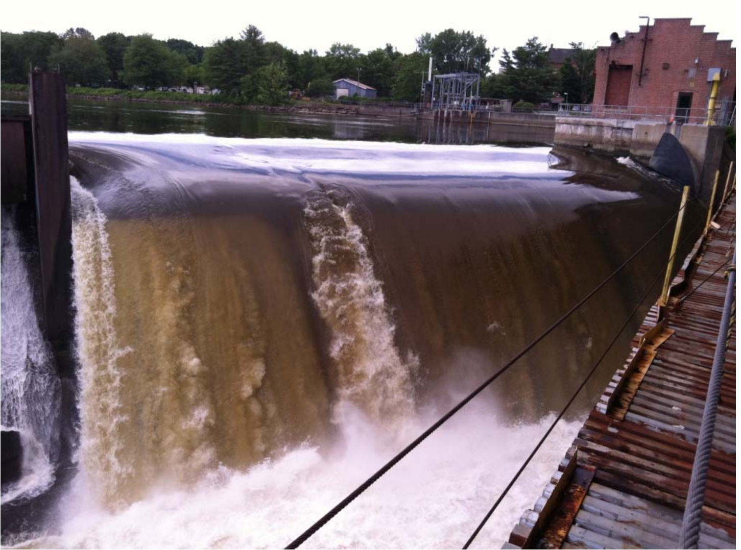
Lower Cable/Metal Deck Platform Below Bottom Truss Chord