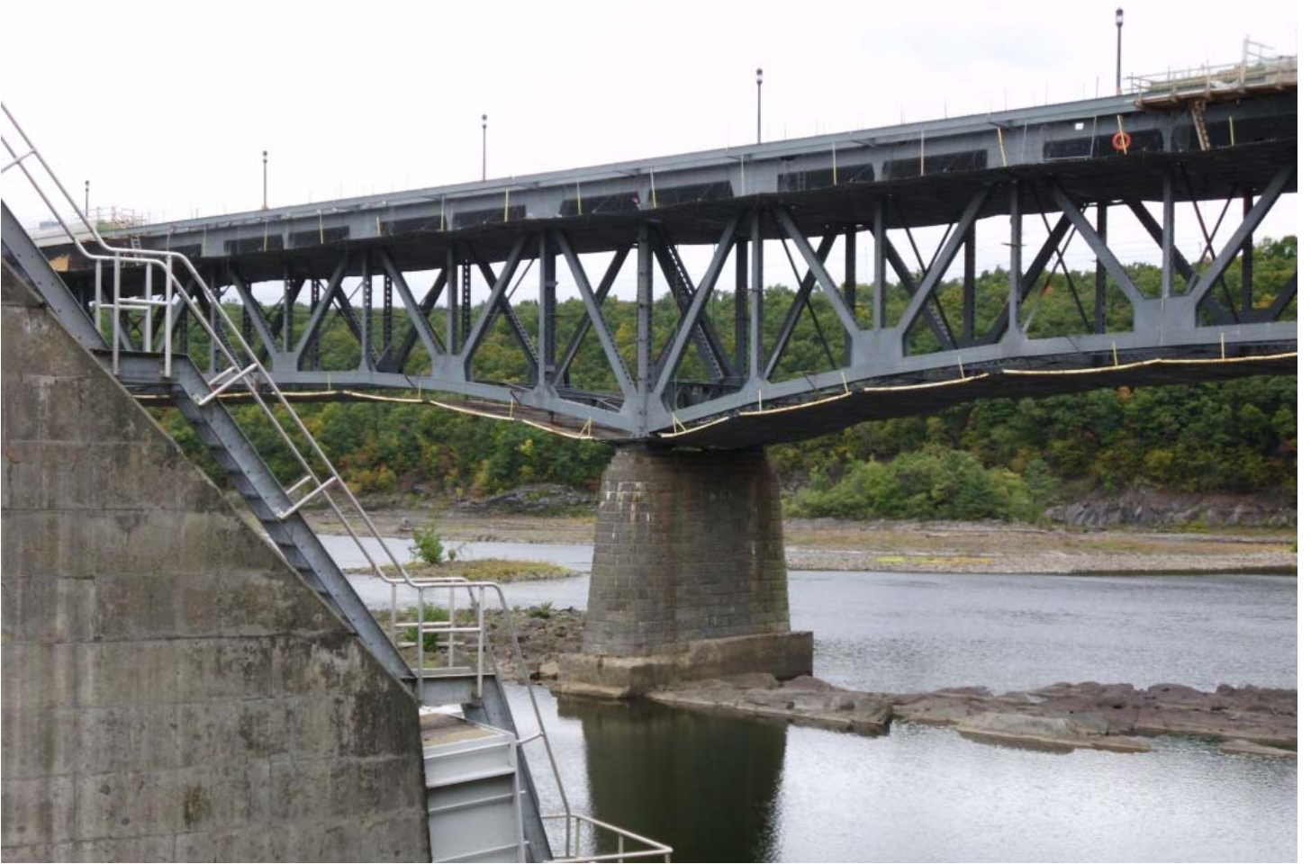
Upper & Lower Level Cable/Metal Deck Platforms