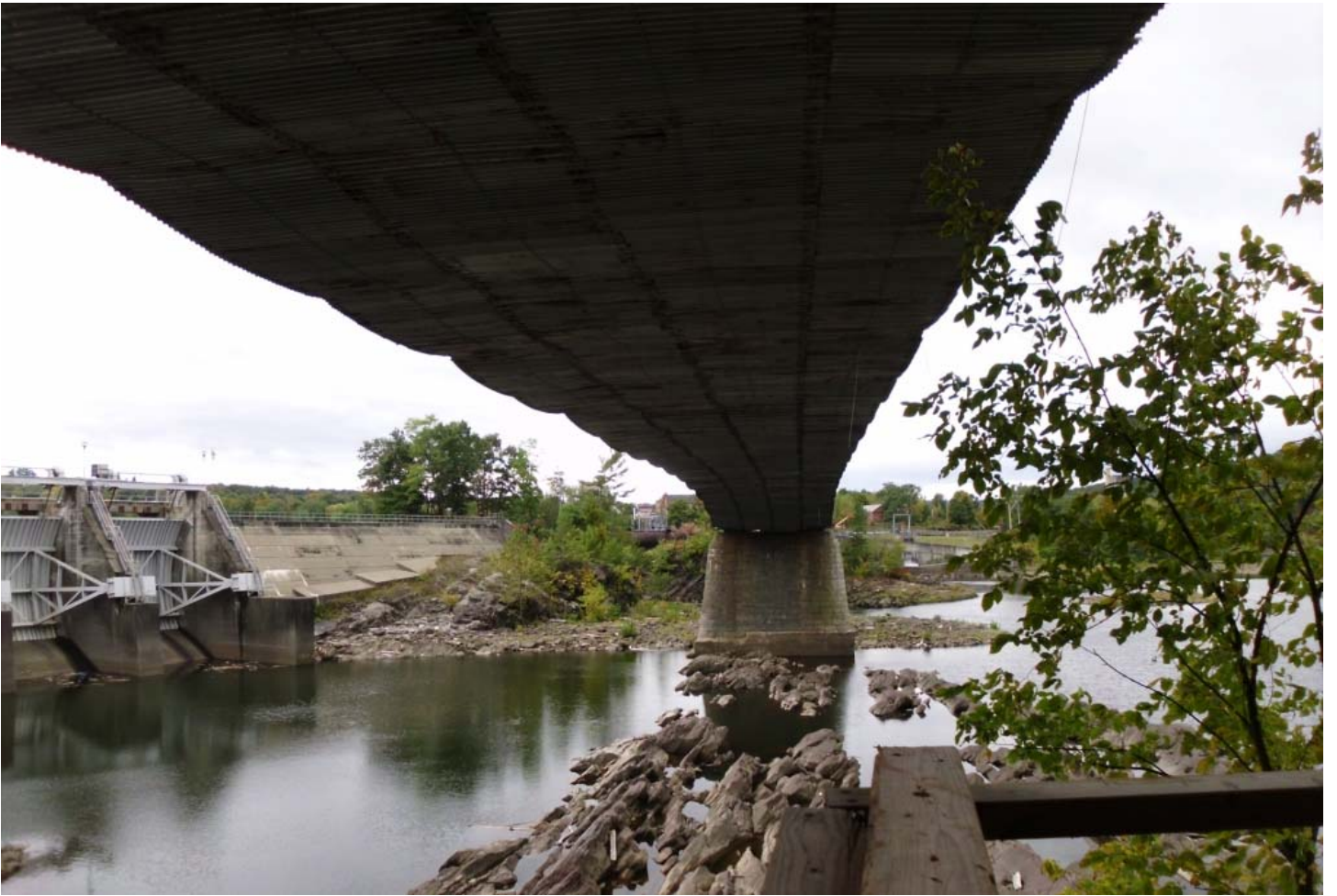
Lower Level Cable/Metal Deck Platform