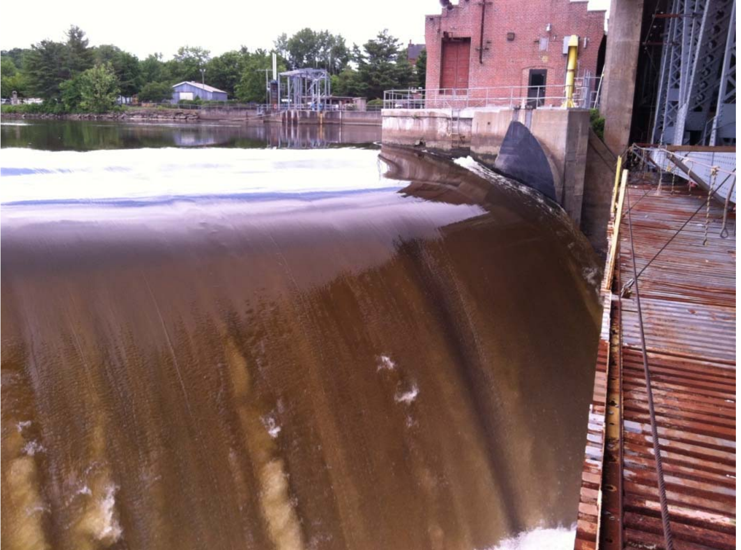
Lower Cable/Metal Deck Platform Below Bottom Truss Chord