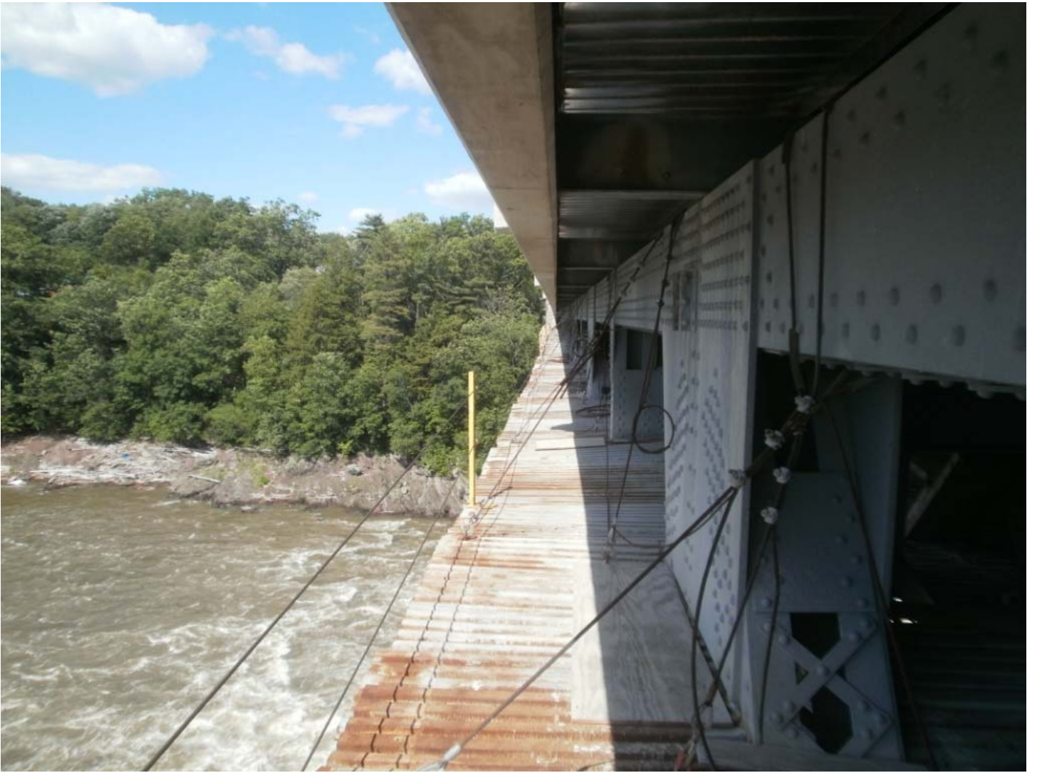
Upper Level Cable/Metal Deck Platform