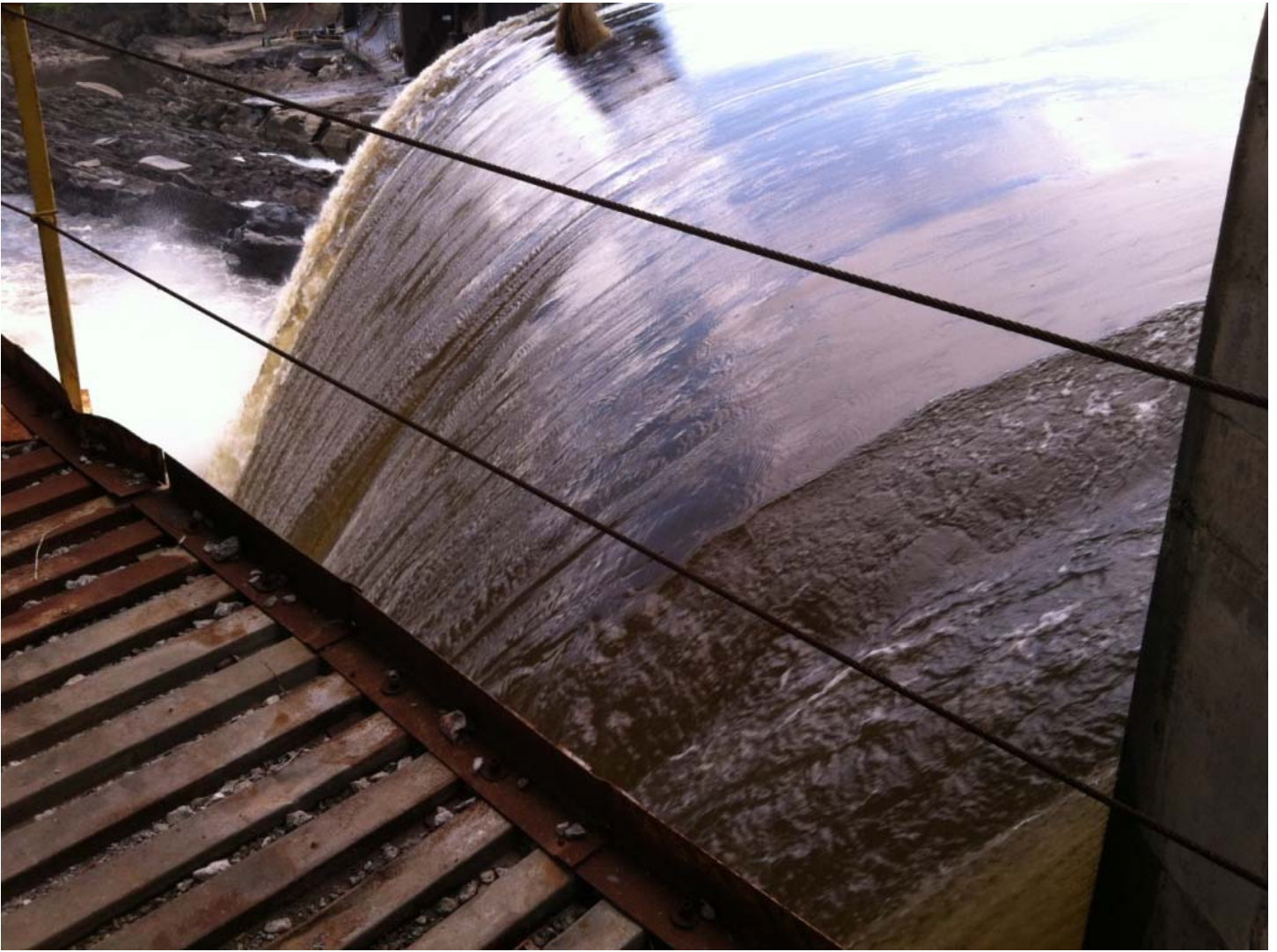
Lower Cable/Metal Deck Platform Below Bottom Truss Chord