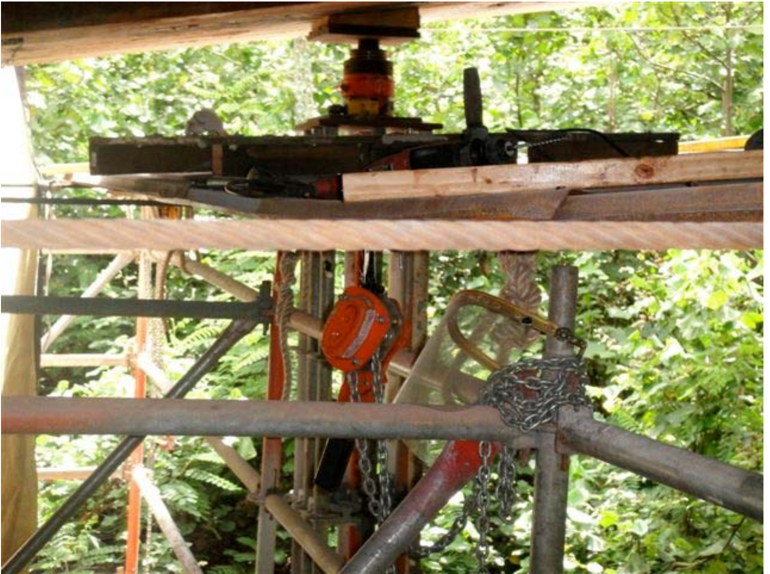
Shoring Support Jacks