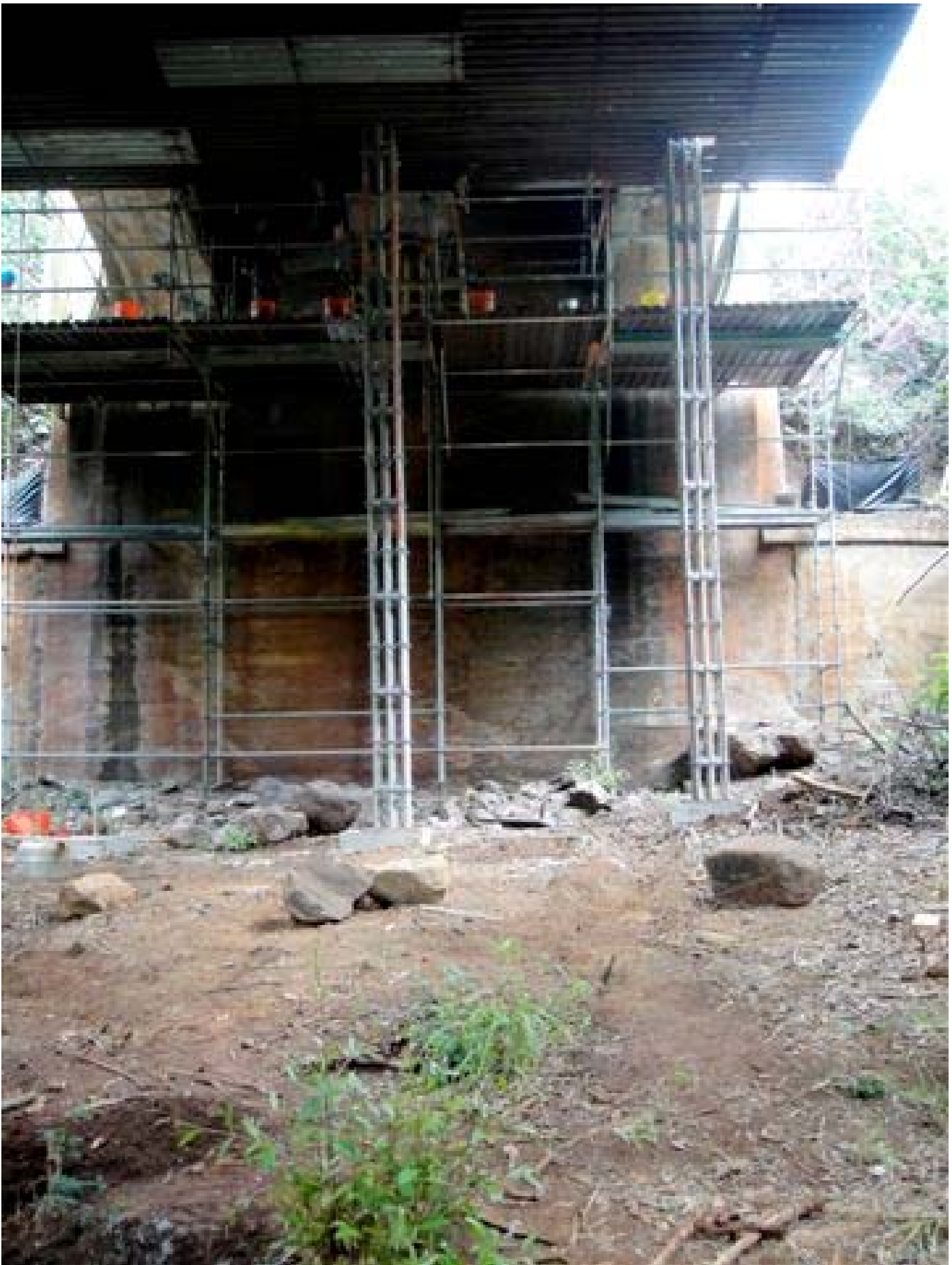
Shoring Support Scaffold Tower