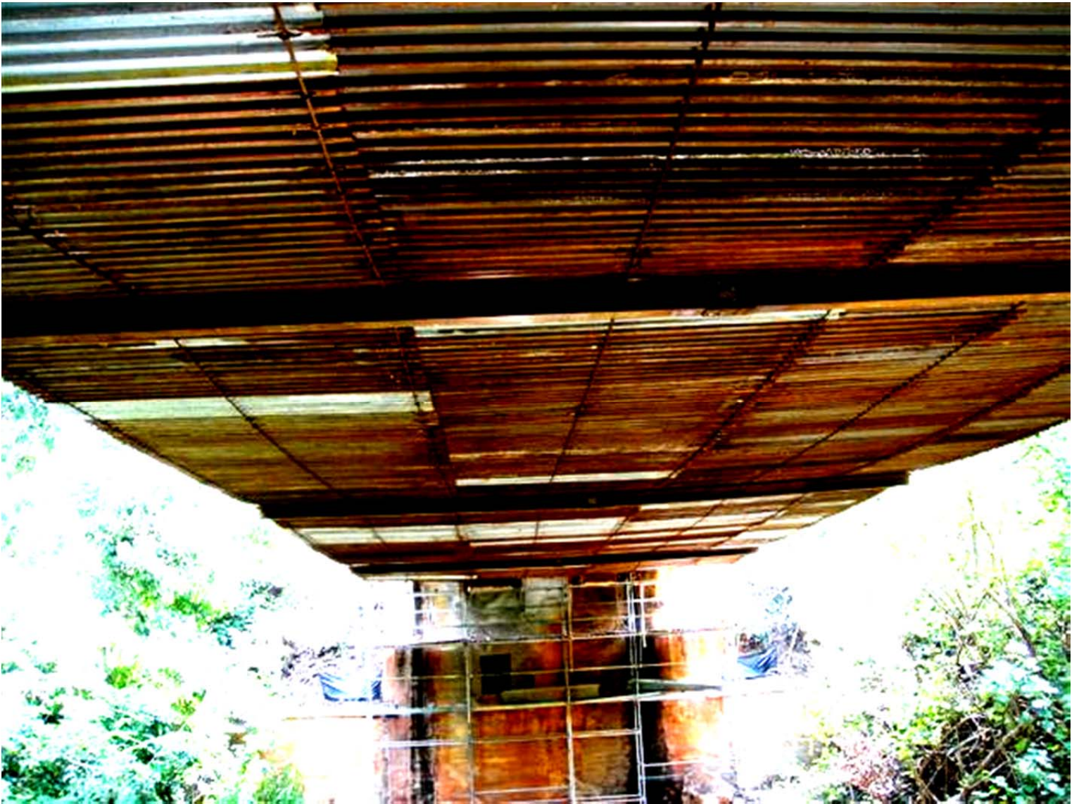
Cable Supported/Metal Deck Platform System W/Center Span Shoring Support