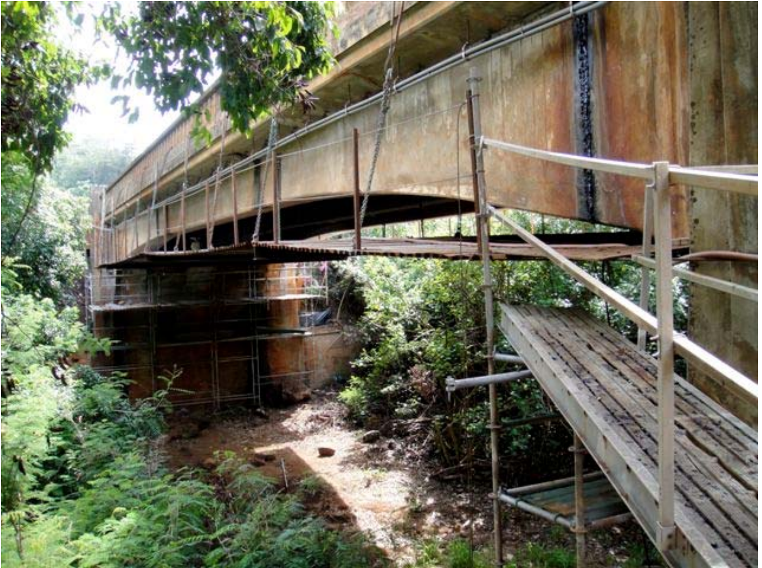
Cable Supported/Metal Dek Platform System

PROJECT DESCRIPTION: Spall Repair Project – Concrete Girder Bridge Cable Supported Metal Deck Platform System