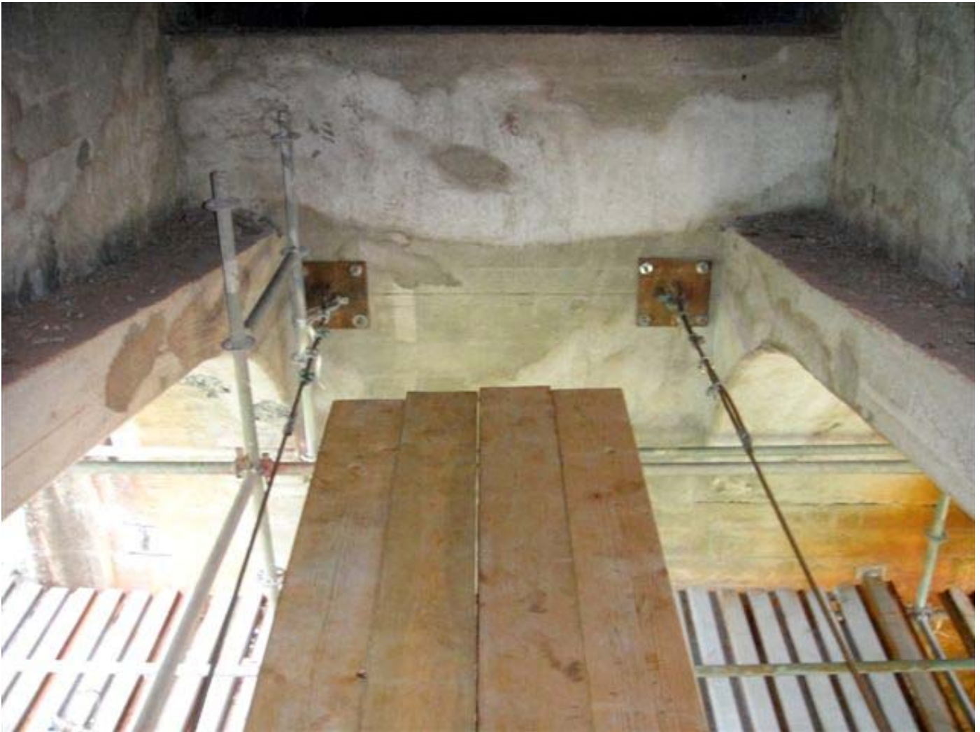
Anchor Plate End Connections For Transverse Support Cables