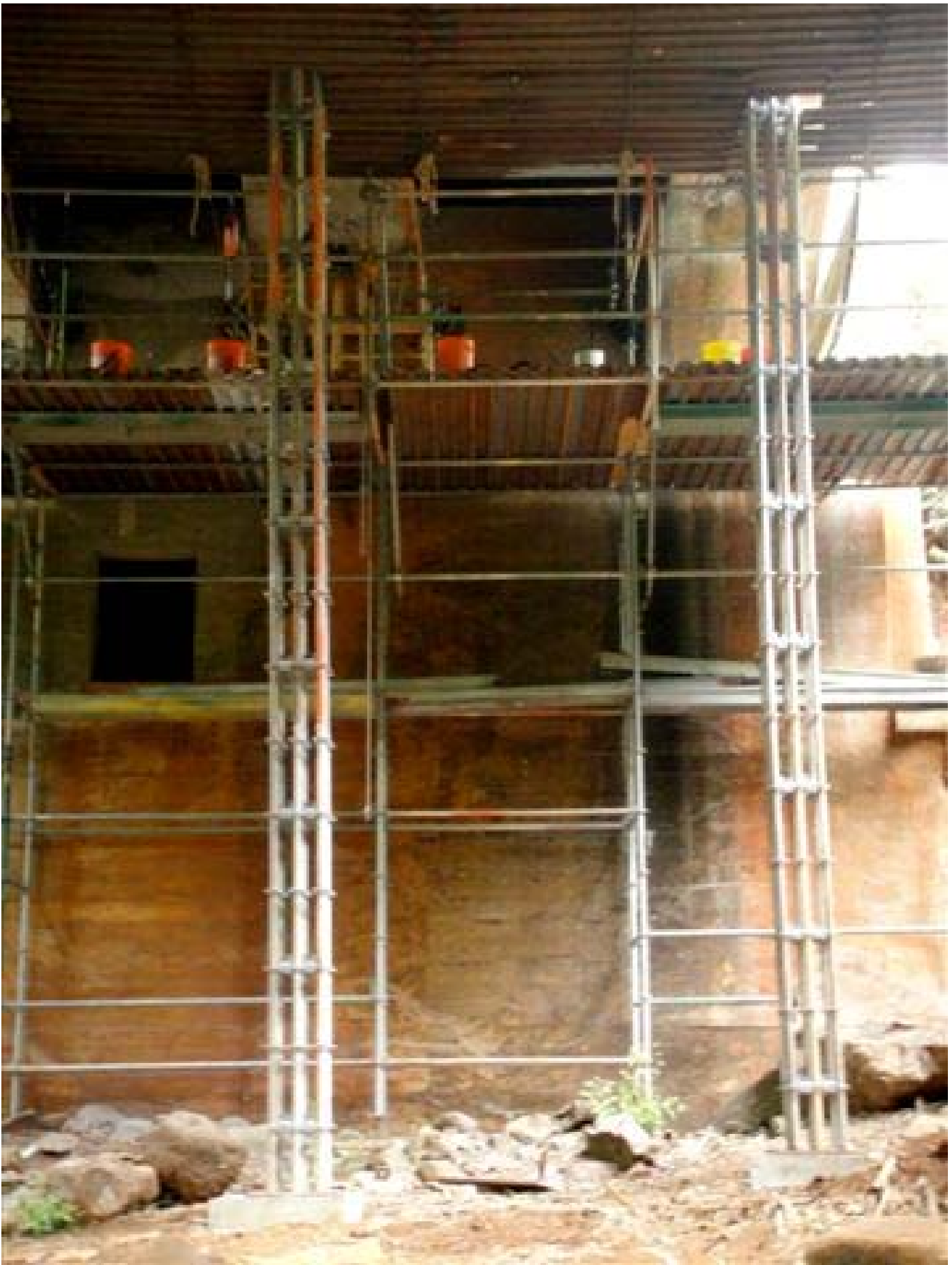
Shoring Support Scaffold Tower