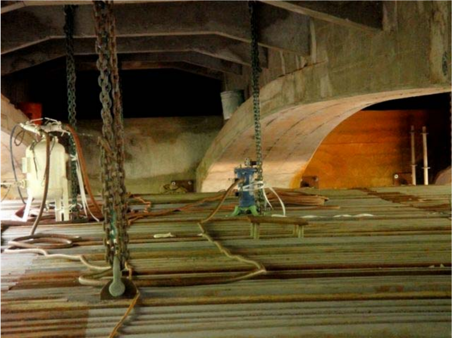
Cable Supported/Metal Deck Platform System Note Anchor Plate End Connections Beyond