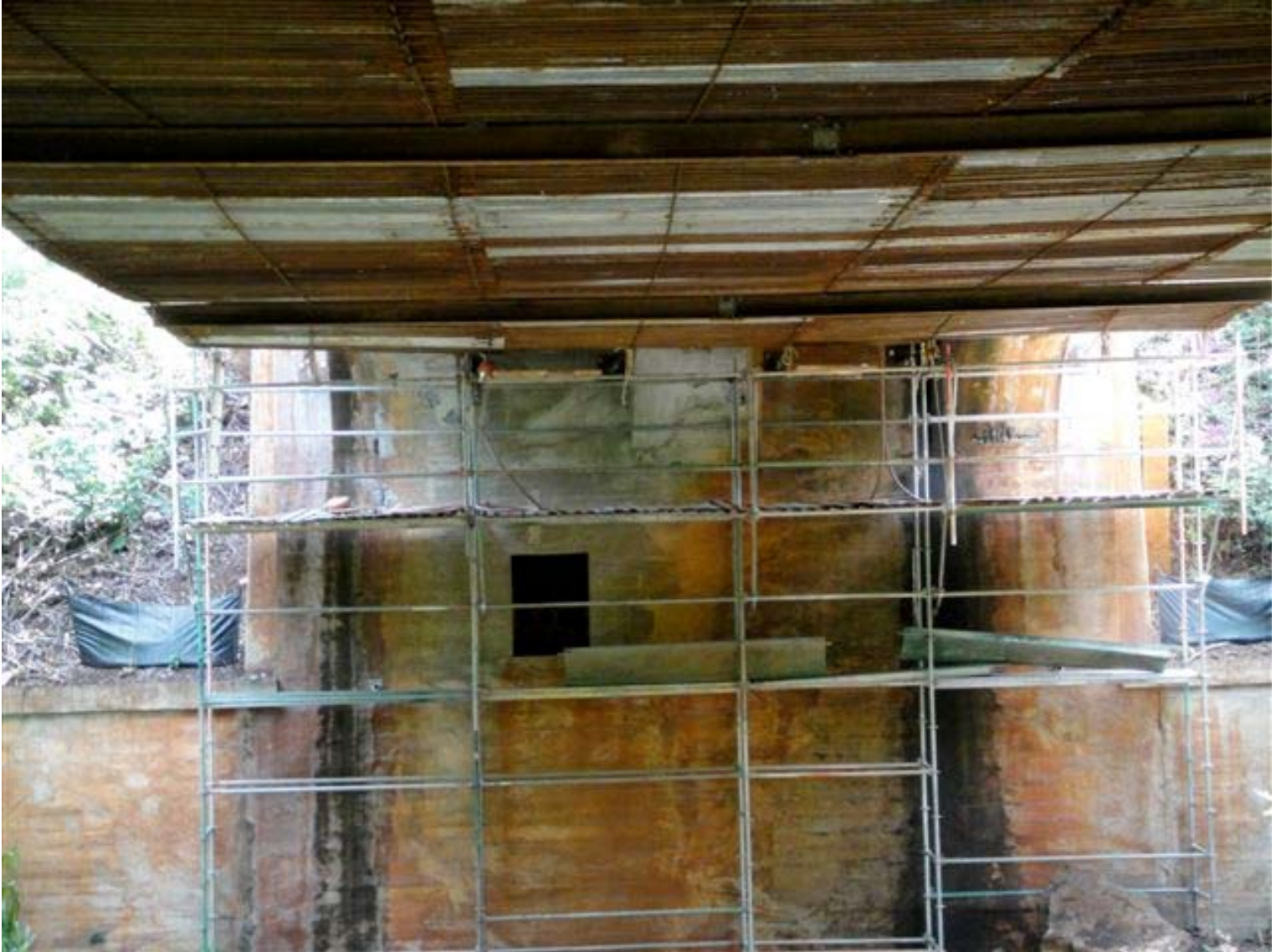
Cable Supported/Metal Deck Platform System W/Center Span Shoring Support Note Anchor Plate End Connections Beyond